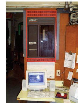
The Energy Management Computer watches for heat and cold around the clock

Once the steam has released it's energy it returns to the CHP as condensate, to be reheated for another cycle. About 90% of the steam returns as water for re-use.