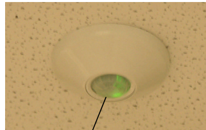
Occupancy Sensor in bathroom