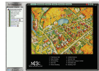
The Energy Management Computer watches for heat and cold around the clock

Once the steam has released it's energy it returns to the CHP as condensate, to be reheated for another cycle. About 90% of the steam returns as water for re-use.