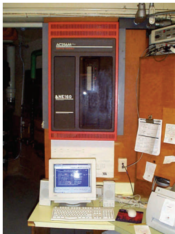
The Energy Management Computer watches for heat and cold around the clock

Once the steam has released it's energy it returns to the CHP as condensate, to be re-heated for another cycle. About 90% of the steam returns as water for re-use.